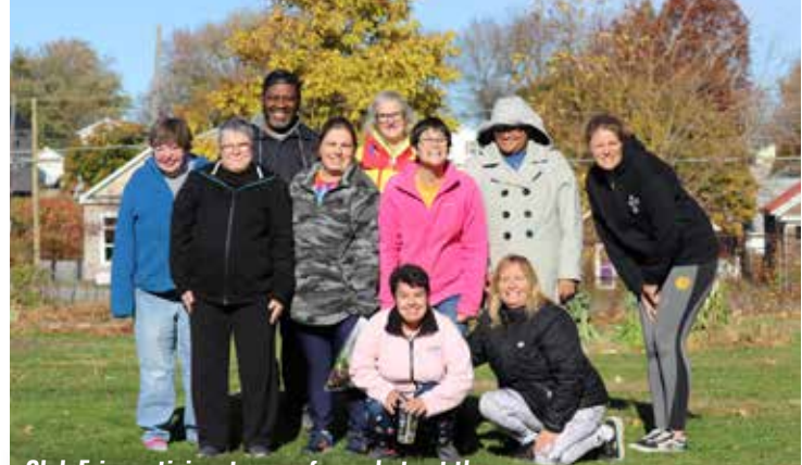
Club Erie participants pose for a photo at the community garden this fall.

Within Barber National Institute, a rich tapestry of careers unfolds, offering a diverse array of professional pathways without the need to seek opportunities elsewhere. Our commitment to employee well-being is evidenced through strategic